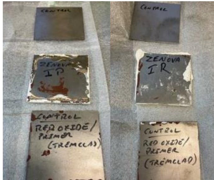
Photo No. 1 Specimens, As Received (Bottom Side for Identification)